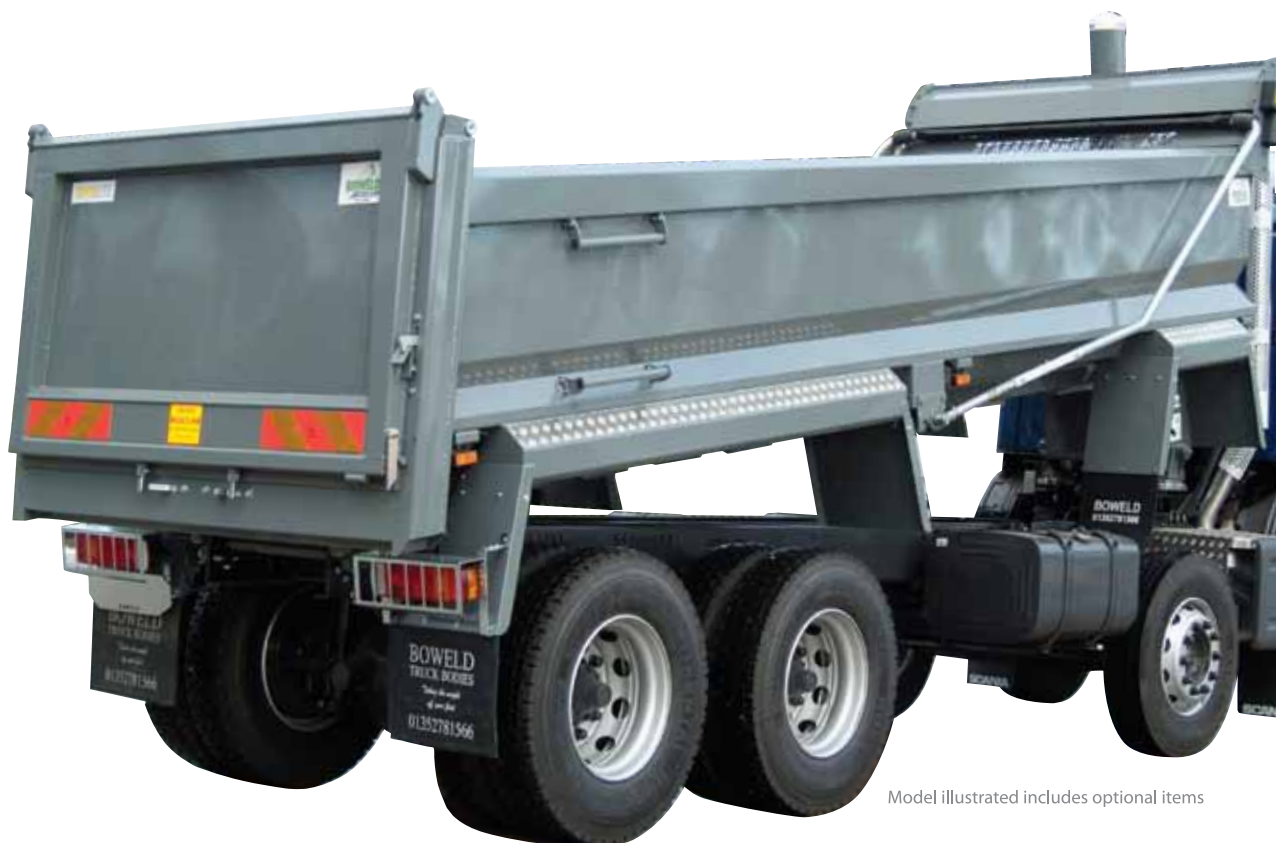
Model illustrated includes optional items