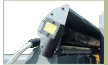
Bolt-on cab guard with view panel.

Uniquely tapered on all four internal planes and tapered from front to rear to give unrivalled easy load discharge and anti stick properties.